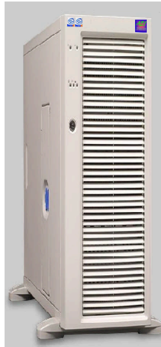
Fig 2: Screamer 1 Server Tower Model 2