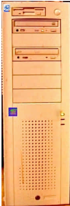
Fig 1: Screamer 1 Server Tower Model 1

From $2335.00* Monitor not included. One year limited warranty. Ask for details.